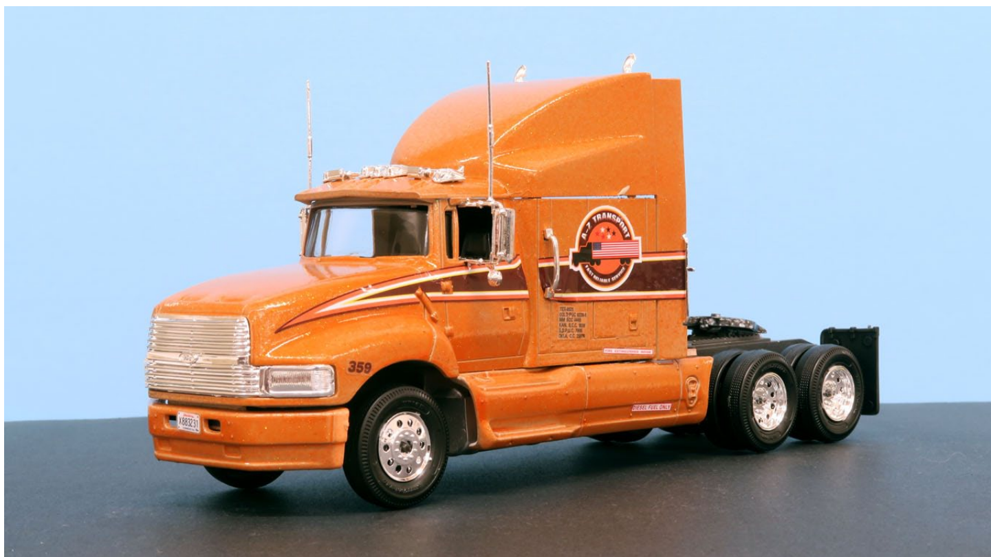
Bart Navarro's 1:32 scale Ford Aeromax semi tractor (Revell Snap-Tite)), built OOB and painted with craft acrylics and Rustoleum clear gloss.