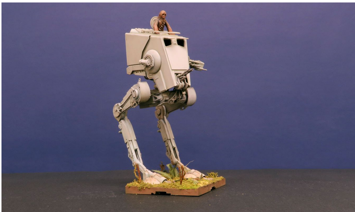
Tom Boisvert's 1:48 scale Star Wars AT-ST Imperial Scout Walker (Bandai) The model was built OOB and painted with Tamiya acrylics.