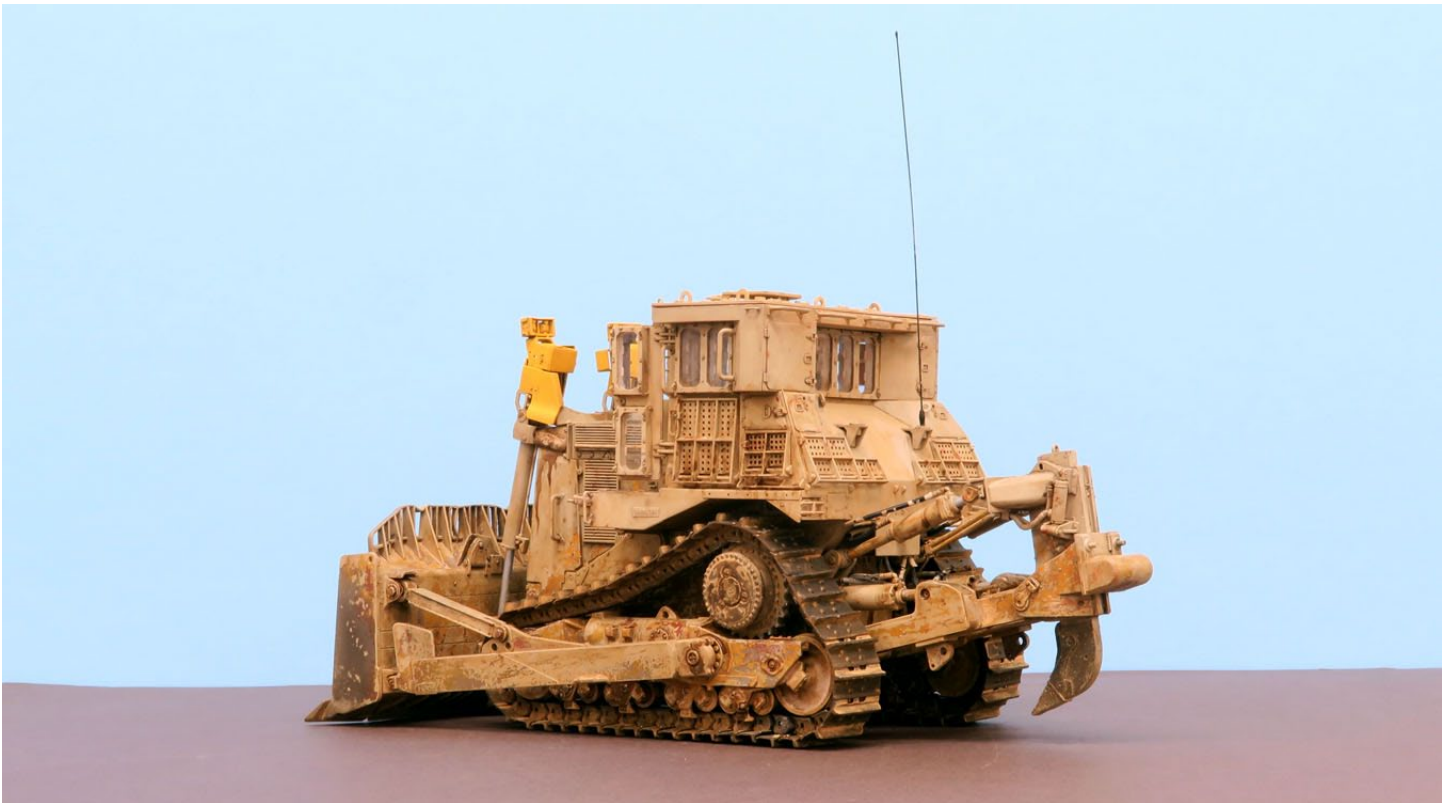
Two more views of Tom Boisvert's 1:35 scale D9R dozer.