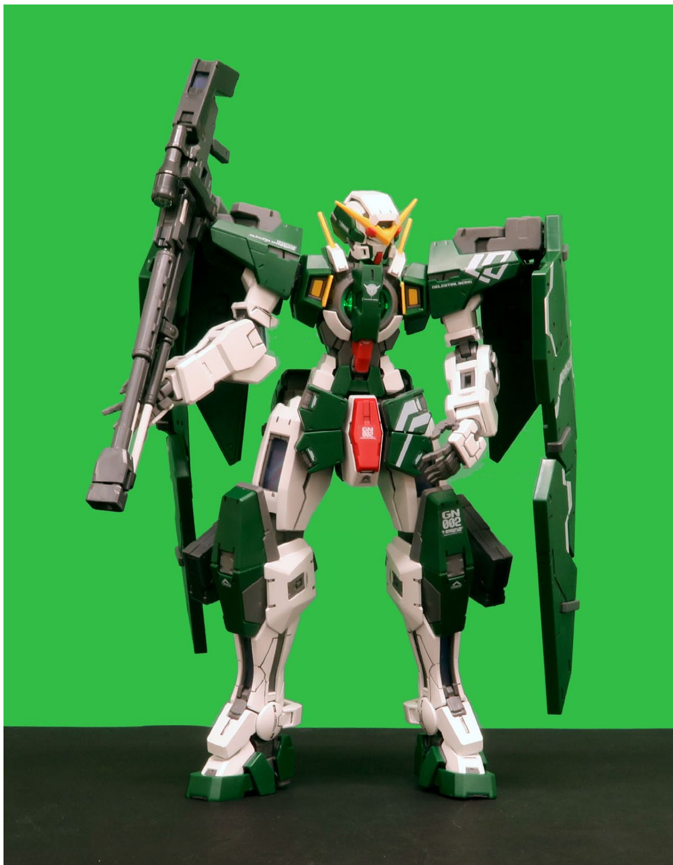
Sean Klingle's 1:100 scale Gundam Dynames (Bandai), built OOB. Sean used panel line shading to accentuate the details and added green LEDs to the cockpit. Sticker decals are from the kit. The model depicts Unit #2 from the Gunam series OO. The kit dates from 2019.